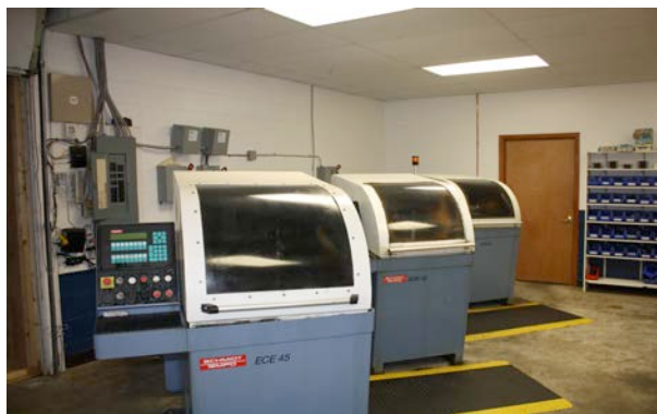
CNC SAW GRINDING EQUIPMENT

The philosophy of PRICE – QUALITY – SERVICE is not just a series of words. We support our customers with fair pricing for high quality and the best service in the industry. We also provide technical support for our tools above and beyond the competition. We have over 35 years of experience in manufacturing which includes layout, set – up and actual hands on machining of the tools we sell.